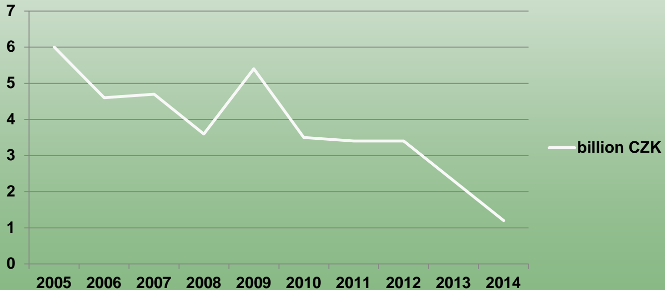
Reimbursement in the CR