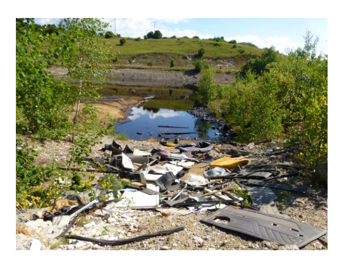
Fig. 2 Contaminated sites in Banská Bystrica region – Predajná