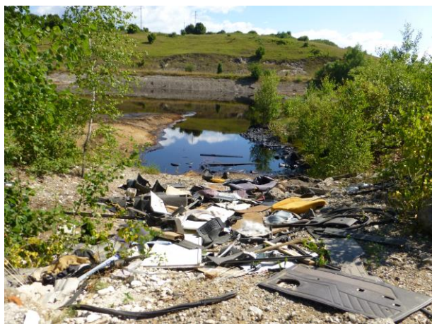
Fig. 2 Contaminated sites in Banská Bystrica region – Predajná

When several sites (PCS, VCS) appeared in the limit value of the first ten according to the number of points, the ranking of priority sites was broadened or reduced with regards to the number of such sites in order to avoid excessive rise or excessive decrease of the number of priority sites in relation to the value of 10.